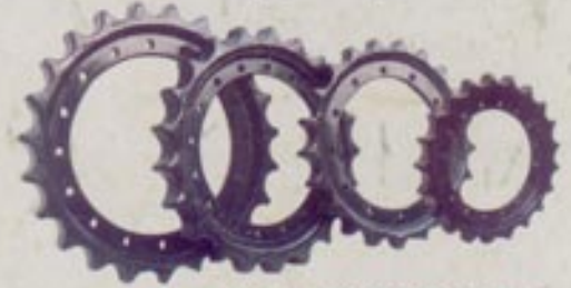
DRIVE SPROCKET Sprocket made out of alloy steel with reinforced geometry at stressed.