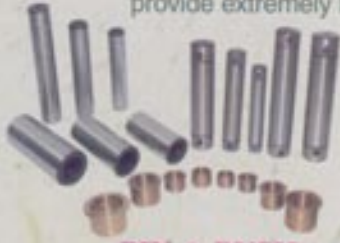
PIN & BUSH

Pins are manufactured from the appropriate alloy steel and induction hardened on the surface with maximum depth provide extremely long wear life.